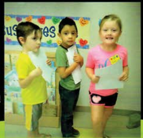
Students from the 2015 Fairview Kindergarten Readiness Camp

Thank you to those who sponsored a student this summer. We want to give a special thanks to Wells Fargo, Walmart Store #670, Walmart Store #7280, Cullman County Commission, and an anonymous donor who made it possible to get matching donations for this year's camp.