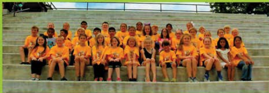
2018 Fairview 2nd Grade AR Students Many of these students attended 2015 Kindergarten Readiness Camp.

Your continued support of this program is making it possible for children all over our county to be prepared for success in the classroom.